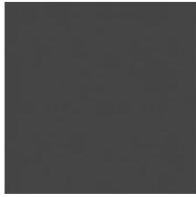
Painted metal Supreme anthracite