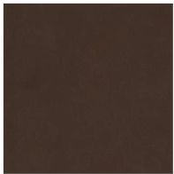
Painted metal Mat bronze